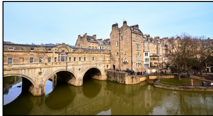
City of Bath see p11

PLEASE BRING CONTACT DETAILS WITH YOU ABOUT WHO TO INFORM IN CASE OF AN EMERGENCY. This should include some form of ID and details of an emergency contact whilst attending outings etc. See p2