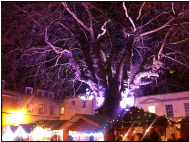
Bath Christmas Market