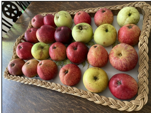
Windfall apples at Killerton House on our visit last October.